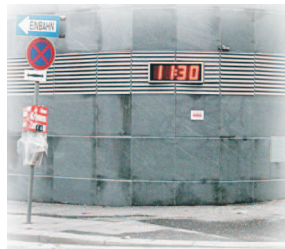
200mm digits, readable up to 100m

ACT Time/Temperature Displays are equipped with an DCF receiver. This solution guarantees always a correct time information and realizes automatically the changing from wintertime to summertime and vice versa. The receiver communicates with the atomic clock in Frankfurt. Radio and television stations all over Europe use DCF as a time reference. As an option we can also deliver it with GPS instead of DCF for countries out of Europe or with 2 simple buttons to adjustable.