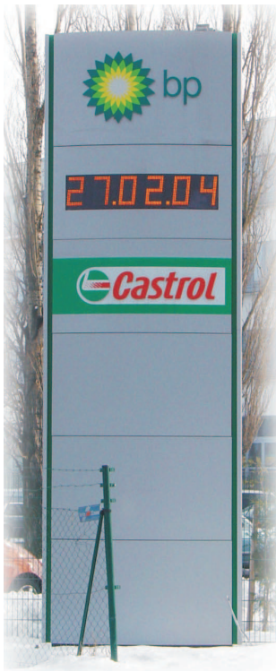
260mm digits, readable up to 130m