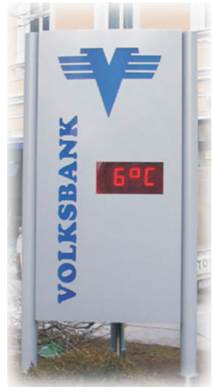
120mm digits, readable up to 60m