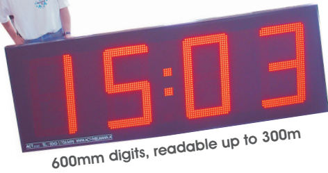
600mm digits, readable up to 300m

Basically our displays are realized with about 3000mcd ultrabright AlInGaP II Leds for absolute good readable also under direct flat sunlight. The brightness intensity can be dimmed automatically with our optional dimmer in 256 steps.