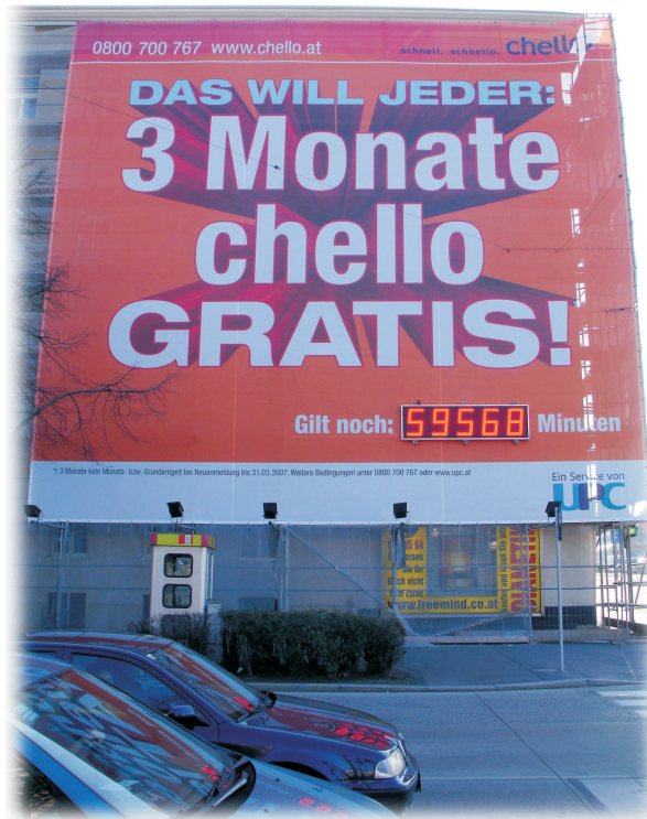
600mm digits, everyone is looking to this count down ...