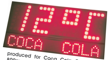
produced for Coca Cola Croatia, 800mm digits, readable up to 400m