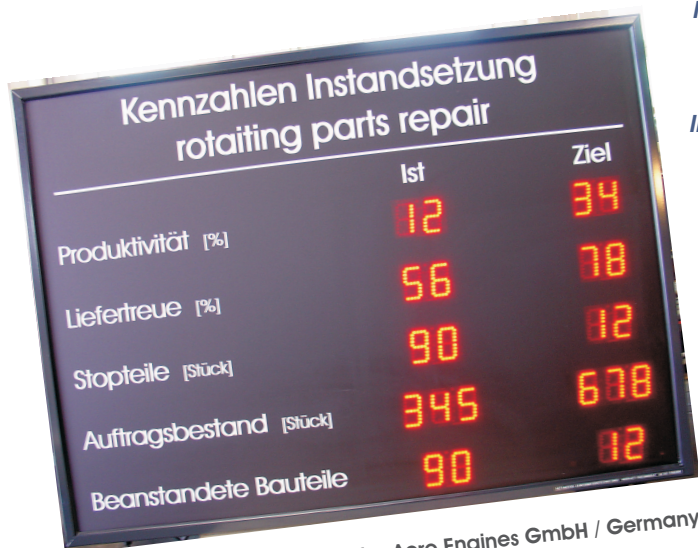
Different units produced for the Aero Engines GmbH / Germany

It's a big motivation for employees if they always be informed about the production target in comparison with just actual datas.