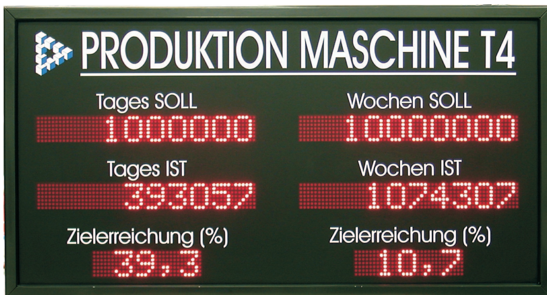
Production informations for the actual day and the week, produced for Floeter Packing Engineering / Germany

User-friendly software, on the PC monitor the exact layout of the led display will be shown.