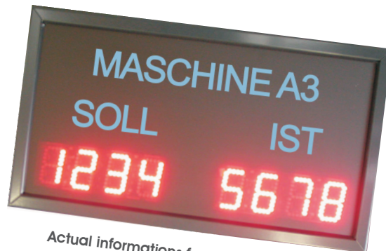
Actual informations for every machine

Also possible to show in foreseen led areas congratulation messages if the production target is caught.