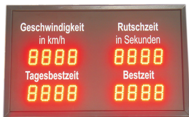
Used for water-slides: speed and time

If counter functions will be used, an automatically updating without any connection to the pc is possible. Different types of interfaces can be used.