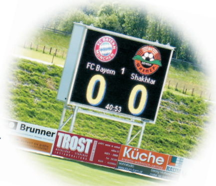
Soccer stadium in Mauterndorf, removable, summer time used in the stadium, in winter time near the ski lift.

With videowalls manufactured by ACT each meeting becomes more attractively, more dynamic and more excitingly.