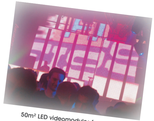
50m 2 LED videomodules for action on the stage

Specially for mobile use and rental applications videodisplays must be working very stable. A very high picture quality is essential.