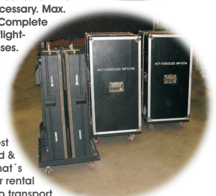
Fastest mounted & removed. That's high important for rental business. Easy and safe to transport, the video modules can be flexible used in every configuration.

We have also for your application the right solution. Our large assortment is your advantage - be well-advised by us!