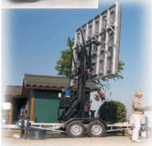
Hydraulically lifting, to turn, to bend ... maximal flexible usable