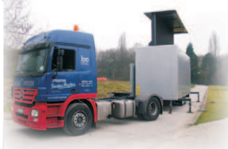
34m² Mega-Videowall mobil on a trailer, perfect for public viewing