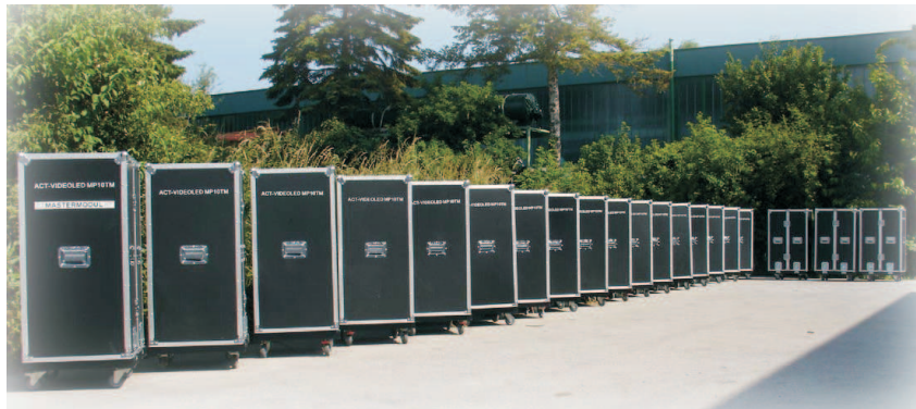
Alu profi rental modules delivered with flight-cases. Easy and safe for transport.

512x384 brilliant shining pixel on a truck. This videowall can be used just within a few minutes after arriving.