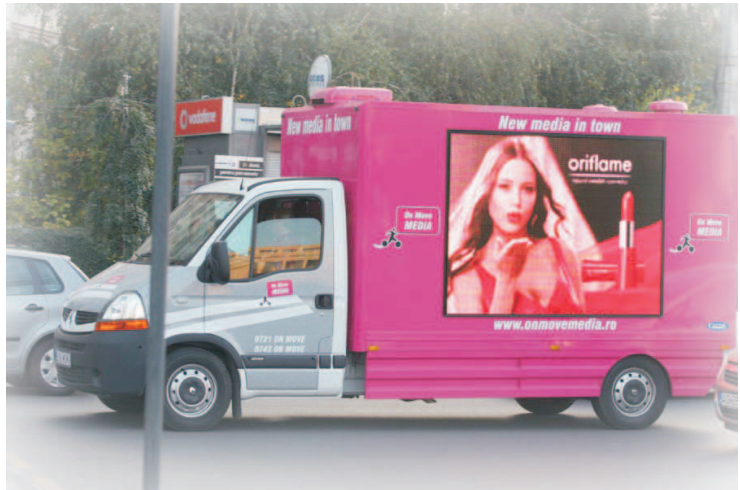
Double-sided video-advertising during driving on the streets of Bukarest/Romania