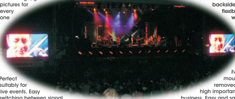
Perfect suitably for live events. Easy switching between signal sources by using push buttons ...

Mobile solutions for public viewing. Fans are supplied with brilliant big pictures and videos, like everyone is placed "in the first row".