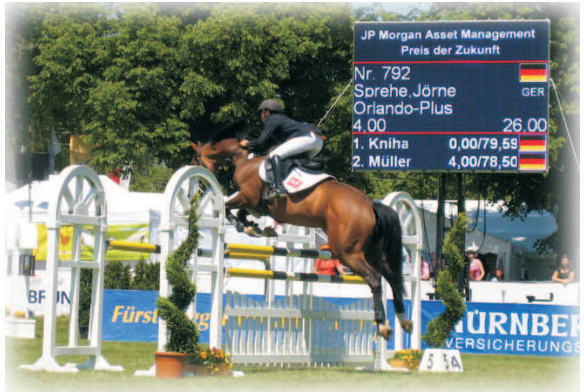
Perfect readable under direct sun!