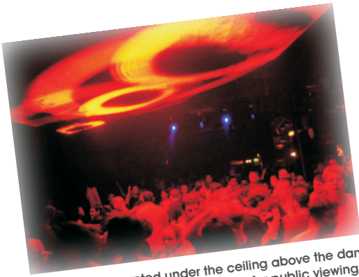
25m 2 mobil mounted under the ceiling above the dance floor, same modules usable outside for public viewing

A lot of different versions with one big common: European prime quality produced by ACT company.